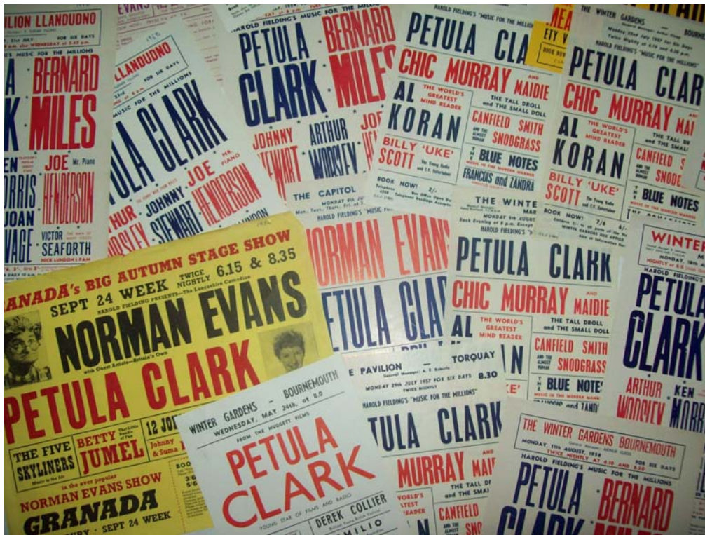
Above: The archive houses an impressive collection of original handbills, many featuring Petula Clark, top-of-the-bill.